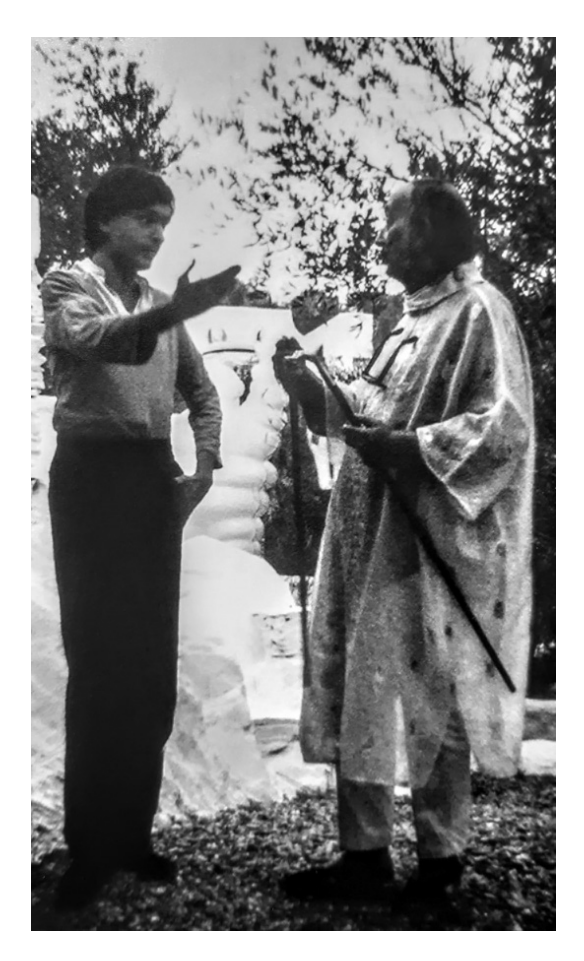
With Salvador Dalí, Cadaqués, 1978.

who at a certain point realizes that if he really wanted to honor literature he must immediately himself become a writer—step inside the bullring and prolong, by other means, what was always at stake in literature.