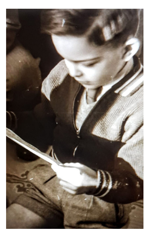
Barcelona, ca. 1953.

struck me. I get the impression that you hide behind your texts. For example, I have no idea about your childhood, where you grew up.